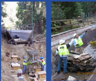
Rebuilding the water conveyance system