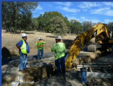
Revitalizing the wastewater collection system