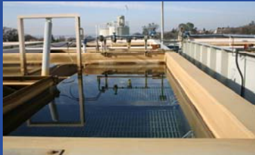
Providing high-quality water