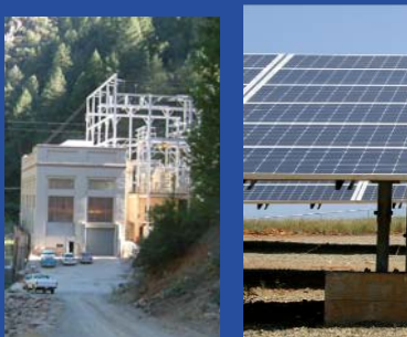
Generating energy and revenue

Below is a summary of major issues related to EID's proposed rate increase of 35% for water, wastewater, and recycled water services in 2010, 15% in 2011, and 5% in each of 2012, 2013, and 2014. The total accumulated increase is 80% over the next five years. The average water bill in 2010 will increase by $8.31 per month. And, the average wastewater bill will be increased in 2010 by $20.07. We encourage customers to read their Proposition 218 notice for more information.