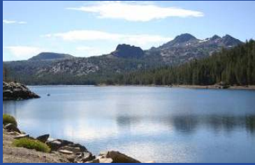
Securing water rights